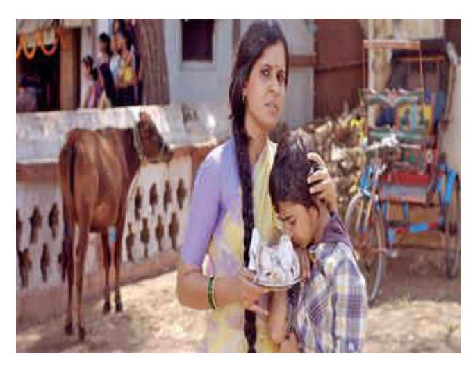
A film festival will question gender binaries and urge young men to dismantle patriarchy

By SOWMYA RAJARAM, Bangalore Mirror Bureau | Updated: Nov 8, 2017, 04.00 AM IST