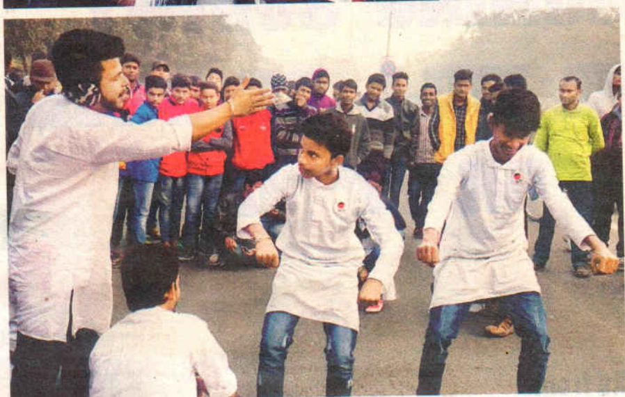
The Men Against Violence and Abuse artists perform the play at Raahgiri Dwarka

lot of awareness has been generated about the idea of masculinity and how it is extremely skewed in society. We all need to introspect." MAVA is expanding to more col-